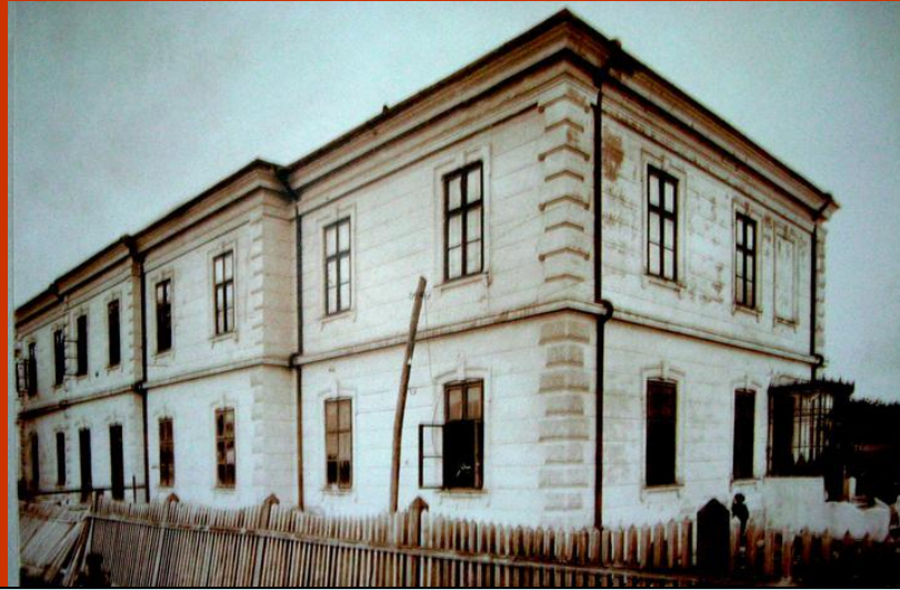
The school building in the year 1906, when it was the Gendarmerie Inspectorate of Oltenita.

Our school was founded on September 1 st , 1910, during Mayor Constantin Deculescu, in a building that belonged to the Gendarmerie Inspectorate of Oltenita, an Elementary School with three classes. In 1924, it is converted to LOWER SCHOOL OF TRADES with 5 classes. They then taught elementary school education and crafts: carpentry, wheelwrights, locksmiths and hardware.